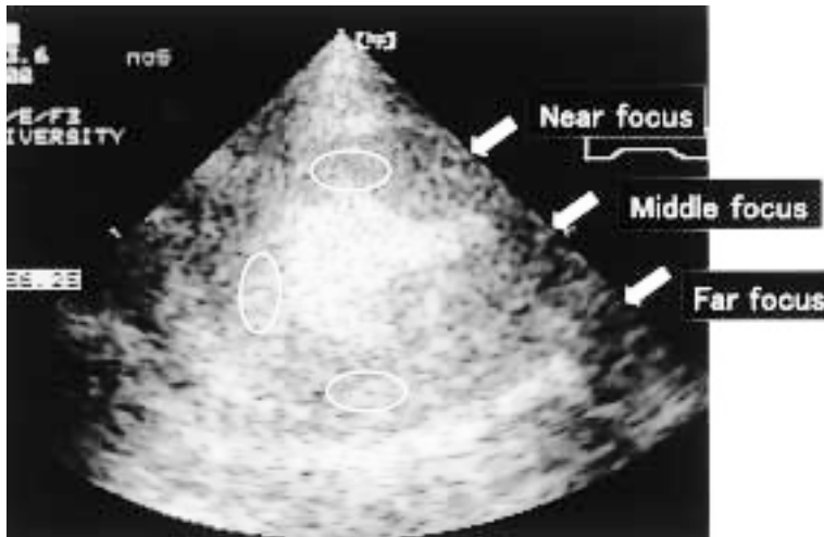
Fig. 1 Positions of the focus points and three different regions of interest

The single focus point was set at near (2 cm), middle (4 cm), far (6 cm), and the multi-focus setting was the combination of the near and far foci.