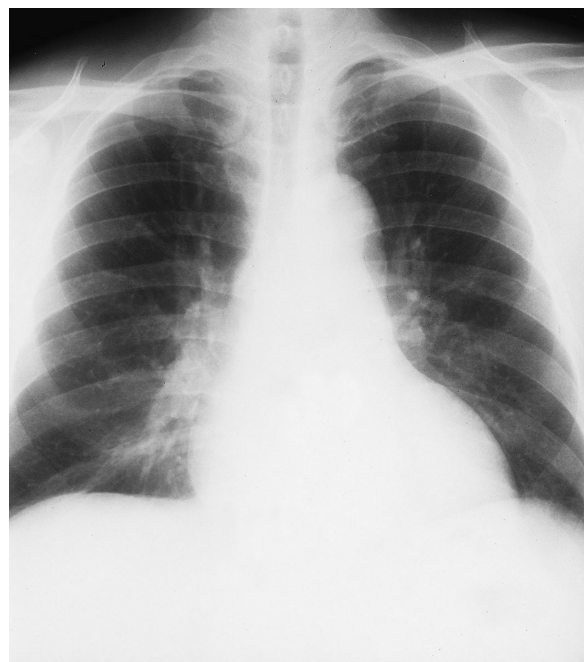
Fig. 1 Chest radiograph on admission

Chest radiography revealed cardiomegaly (cardiothoracic ratio = 56%) with mild pulmonary congestion (Fig. 1). Electrocardiography showed R wave retraction in leads V_3 - V_4 , biphasic T wave in leads V_2 - V_5 and ST segment depression in leads V_1 and V_5 - V_6 (Fig. 2). Abdominal computed tomography showed hepatosplenomegaly with mild ascites. The conduction velocities of the median nerve and tibian nerve were decreased. Bone scintigraphy showed no osteolytic or osteoclastic lesion. Bone marrow puncture showed mild plasmacytosis without plasmacytoma. Lumbar puncture was not performed. Echocardiography showed left ventricular hypertrophy and dilation with normal contractility (interventricular septal thickness, left ventricular posterior wall thickness, left ventricular end-diastolic diameter, left ventricular end-systolic diameter and ejection fraction were 14, 12, 65, 40 mm and 68% respectively). The left atrium and aortic root were slightly dilated and mild pericar-