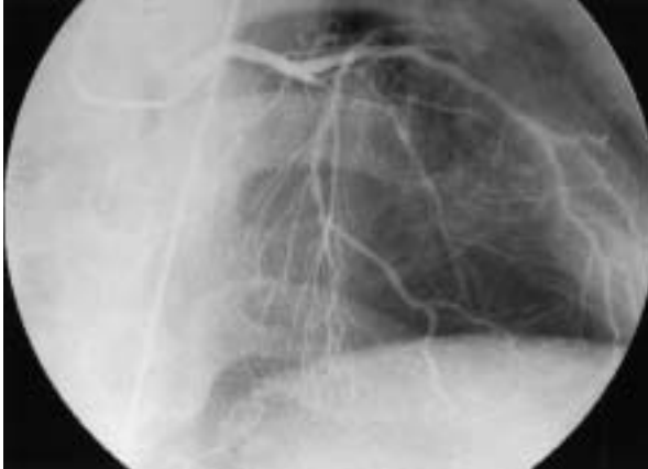
Fig. 2 Left coronary angiography( cranial view ) showing the in-stent restenosis before second intervention

deterioration of left ventricular function. At that time, more aggressive renal protection was considered necessary. Continuous hemofiltration with fluid replacement of 1,000 ml/hr starting 2 hr before the PCI and continued for 18 hr was performed. Coronary angiography showed 99% in-stent restenosis and cutting balloon angioplasty was performed. Volume of contrast media was 180 ml. Serum creatinine increased to 1.95 mg/dl (20% from baseline) at 72 hr after intervention and returned to the previous level after 6 days ( Fig. 1 )