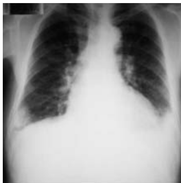
Fig. 2 Chest radiograph

clinical course, the diagnosis was congestive heart failure. He then underwent Y-graft replacement and common iliac arteriovenous fistula ligation (Fig. 4). Postoperative right cardiac catheterization revealed marked improvements in pressure data