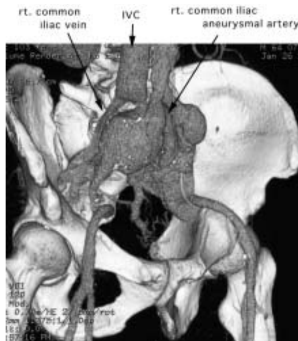
Fig. 1 Abdominal three-dimensional computed tomography scan

The results of cardiac catheterization and contrast-enhanced aortography were as follows: common iliac arteriovenous shunt rate was 80.6%, Qp/Qs was 5.0, and O 2 step-up was seen in the common iliac vein (Table 1). Shunt flows were confirmed at the right common iliac vein and right common iliac aneurysm (Fig. 3). Based on the