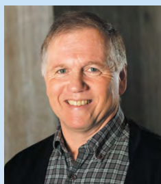
Vilhelm Bohr National Institute of Aging